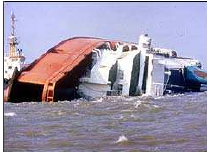
The capsizing of the Herald of Free Enterprise